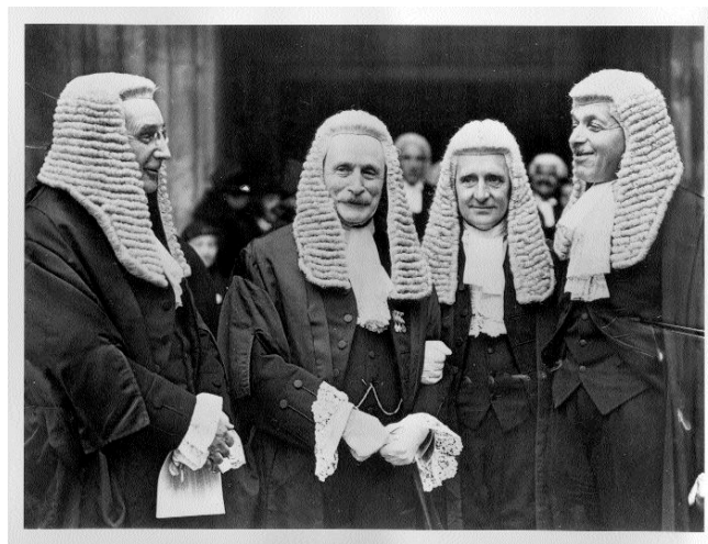
Deciding on the transcript

Evidence is recorded on sound and often transcripts leave a lot unclear. Video recording is not yet in general use by courts except in “protective” or “security-sensitive” or distance-effected situations, but the technology is available and it may